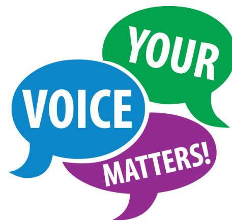
What should the Board's Priorities be for 2023-24?

The Board's Annual Survey 2022-23 was completed by 414 members of the general public and professionals. Thank you to those who completed it. The feedback from each survey has been collated to provide an overall view, illustrated below. The results will help the Board to develop the TSAB Business Plan for 2023-24. Further detailed analysis will be published as part of the Annual Communication and Engagement Report in June.